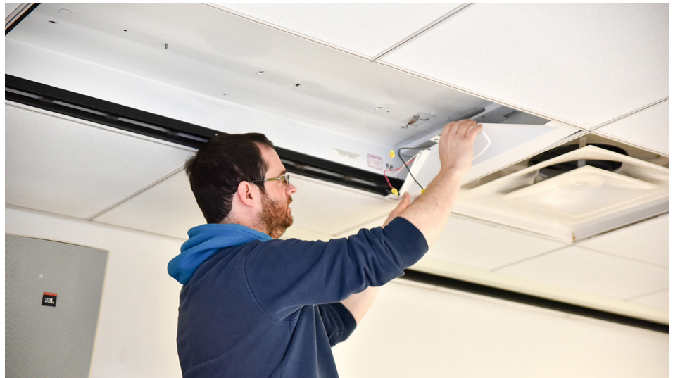
Skilled installers can convert a troffer to a luminaire conversion kit in 10 minutes.

Section 2-1.4, Life Cycle Cost , requires that labor (including replacement) costs associated with equipment replacement be included in life cycle cost calculations. LED conversion kits are designed to be