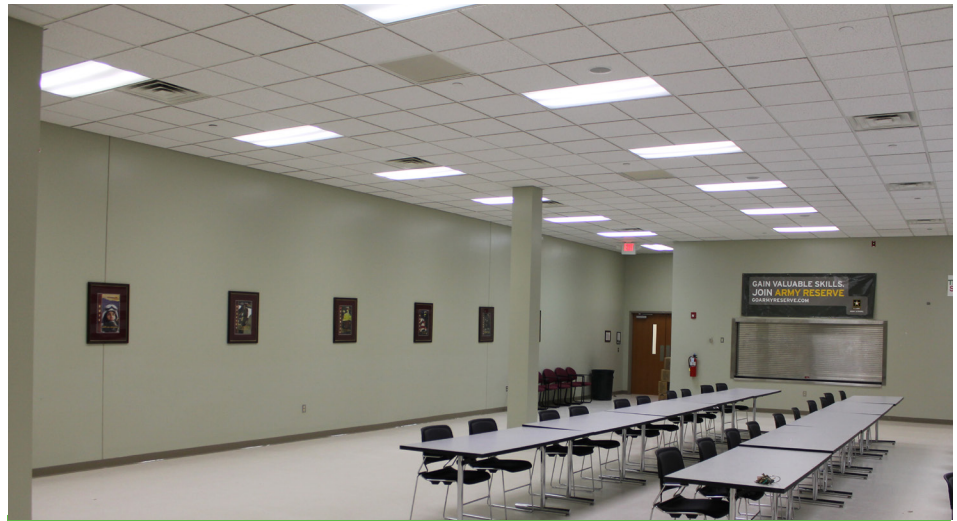
Fort Devens Army Reserve Center troffer retrofit.

Section 2-1.1, Energy Reduction , states energy consumption can be reduced by using energy-efficient technologies and effective illuminance levels and implementing control strategies. Section 4-1.1, Energy Reduction , acknowledges that LED fixtures are more efficient than most high-intensity discharge (HID) fixtures. LED and induction technology have proven energy savings, which is the first consideration for all exterior applications. Typical fluorescent and HID fixture efficacy is 55 to 75 lumens per watt (lm/W). There is no explicit